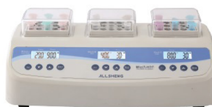
Block A Block B Block C